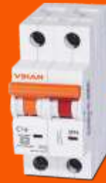
Single Pole + Neutral