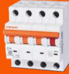
Triple Pole + Neutral